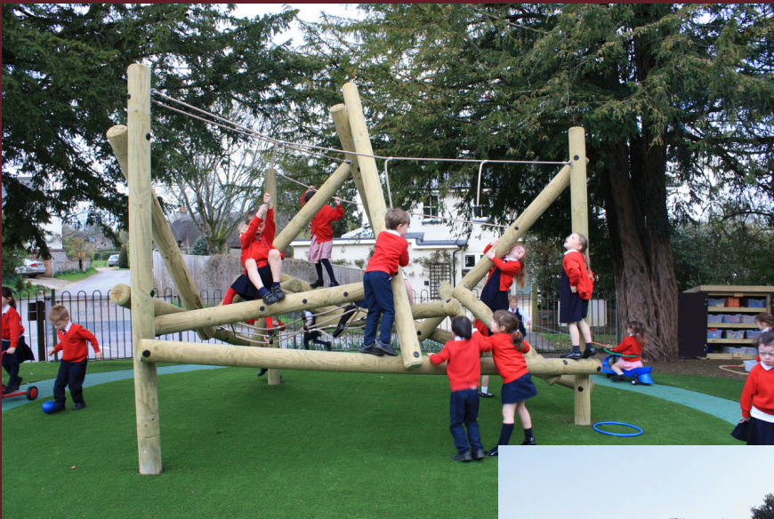
The Bowfell climbing frame

On February 26th, during Parents Evening, Relish will host a taster session. This is a great opportunity to sample some dishes that your children enjoy at school and to have a chat with the catering team. We invite you to visit them in the hall on Wednesday between 3:30 PM and 6:00 PM.