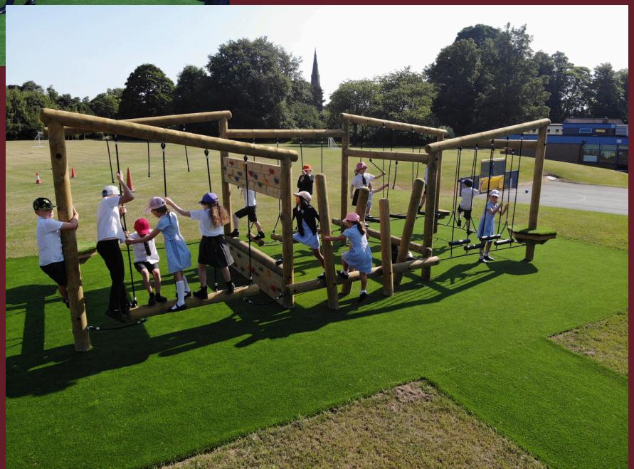
The Kielder Forest Circuit